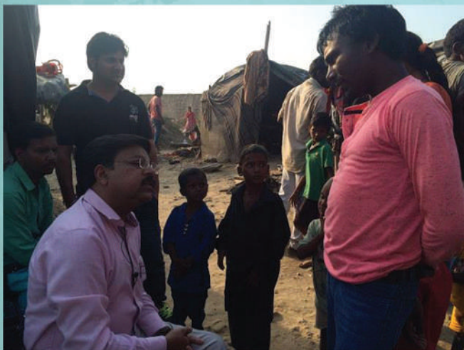
FREE HOMEOPATHY HEALTH CAMP ORGANIZED BY AGRAWAL HOMEOPATHY CLINIC AT E BLOCK, VASANT KUNJ