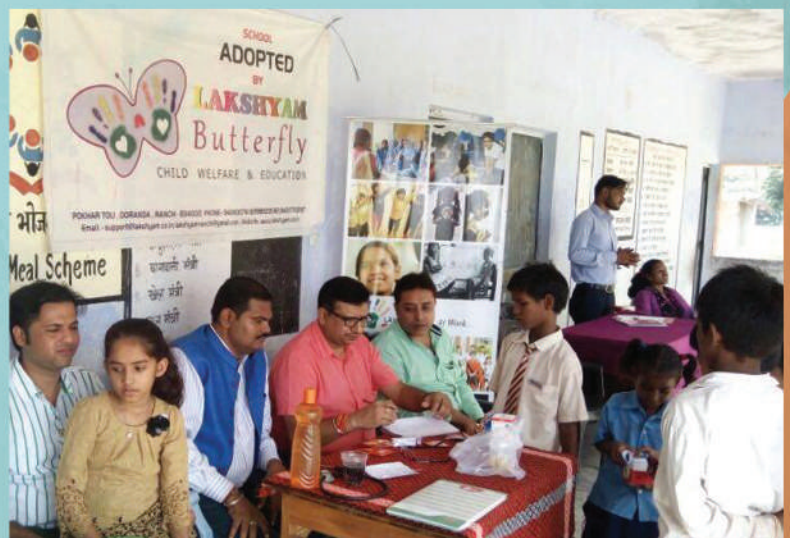
A HEALTH CHECK-UP CAMP ORGANISED BY