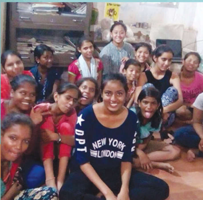
WORKSHOP ON MENSRTUATIO N CONDUCTED BY STUDENTS OF LADY SHRI RAM COLLEGE