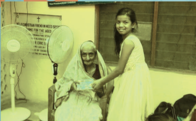
SUMMER CAMP BY IIT DELHI AND VISIT TO OLD AGE HOME